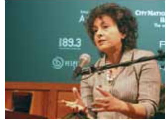
Irene Khan, Secretary General, Amnesty International